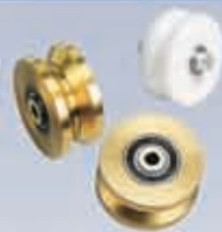
V Groove Wheels Solid steel and UHMW wheels available.