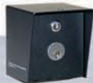
Key Switch Box Suitable for use on entry doors where access is restricted by a key.