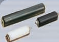
Guide Rollers Heavy duty UHMW rollers available in various lengths.