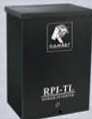
RPI (Ramset Power Inverter) Maintains power to your operator and accessories when the main power is lost. 750W output.