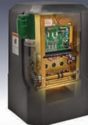
RAM 1000 Commercial Industrial