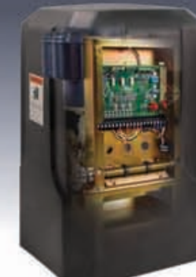
RAM 5500 Commercial Industrial