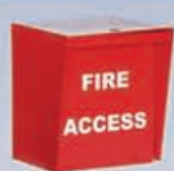
RAMSET Fire Box Allows the fire department to open your gate in the case of an emergency.