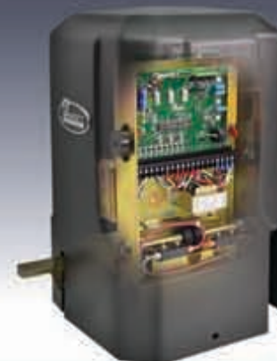
RAM 100 Residential Commercial