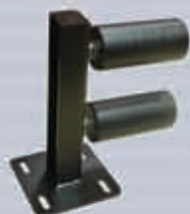
Adjustable Guide Roller Heavy duty UHMW rollers adjust to fit any gate.