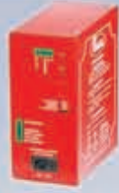
RAMSET BBS-Battery Back-Up System Opens your gate when power is lost.