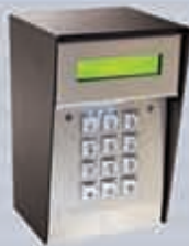
Keypad 1,024 Codes 5,112 Event Log LCD Display 7-Day Timer Time Zones Latching Stainless Steel Faceplate