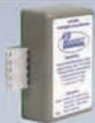
RAMSET ILD-24S Loop Detector A safety device that stops the gate from closing on a vehicle.