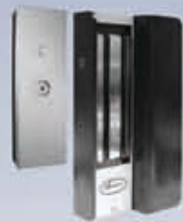
RAMSET Magnetic Lock Secures the gate(s) closed.