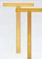
Post Mounts 1/4" angle iron flats, 3/16" square tubing legs. Used to mount the operator off the ground.